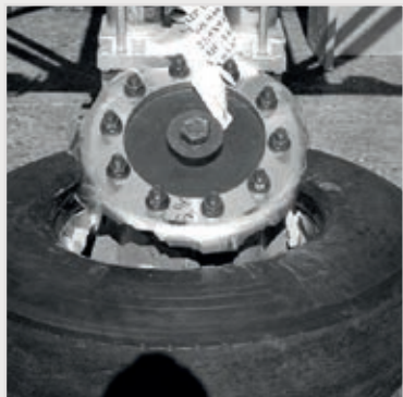
Cast aluminium wheel