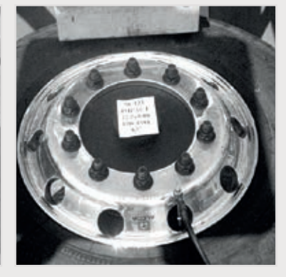
Forged aluminium wheel of Alcoa Wheels

This all translates into less downtime for fleets. Forged aluminium Alcoa Wheels regularly last for 20 years or more in service.