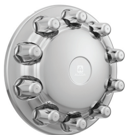
CHROME PN 079600DT