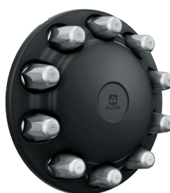
MATTE BLACK WITH CHROME NUTS PN 079800DT