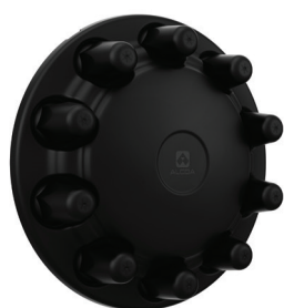
MATTE BLACK PN 079700DT